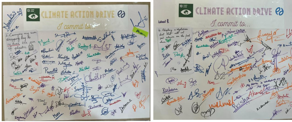
Participants at the Climate Action Drive (all age groups participated)

3. To spread awareness about the Sustainable Development Goals and targets, a quiz program around SDG was organised for students from class 8 to class 12 The program was well-received, with Kendriya Vidyalaya Hebbal emerging as the winner of the quiz.