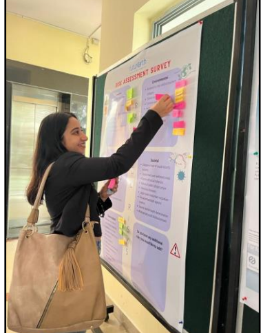
Participants in the Risk Assessment Survey

2. The Signature campaign aimed at encouraging individuals to commit to environmentally conscious actions for the year. The campaign was part of the Climate Action Drive and received significant engagement from the public.