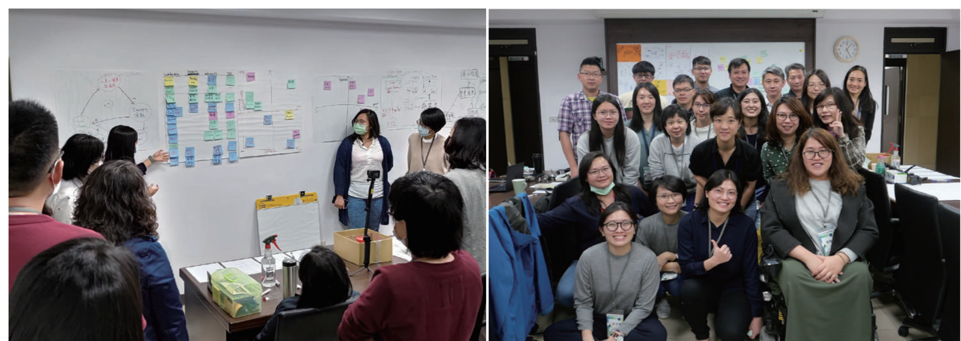
• Workshop on Transdisciplinary Research on Health for ECRs (3-5 Feb 2021)