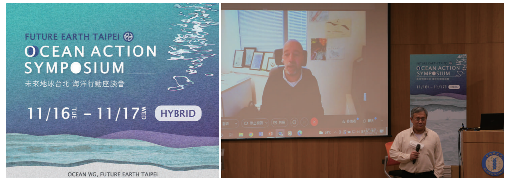
• Ocean Action Symposium (16-17 Nov 2021)