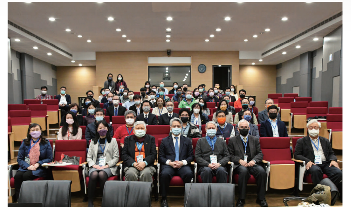
• Annual Symposium, 100+ Domestic Scientists and Stakeholders (In-person / Online; 2021, 2022)