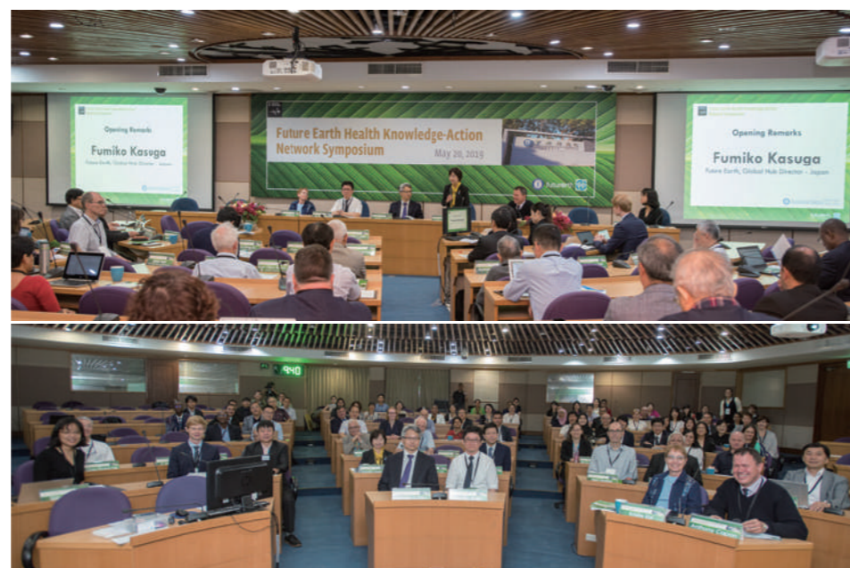
• Future Earth Health KAN Symposium and Launch Event (20 May 2019)