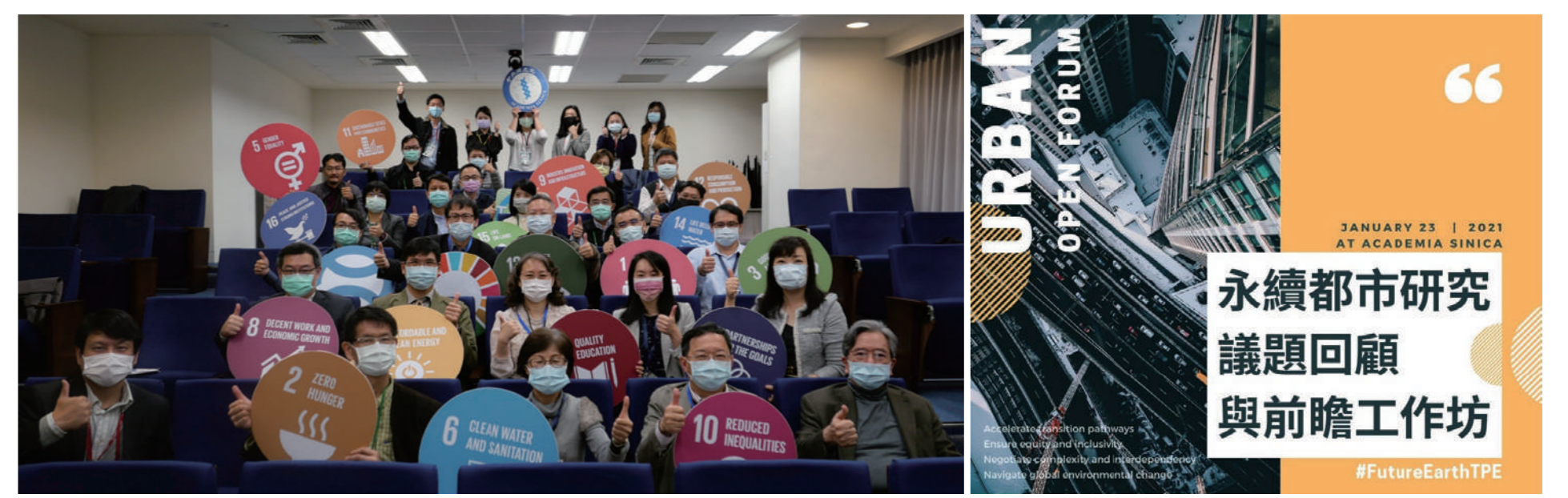
• Taiwan Urban Sustainability Research Retrospective and Prospective Workshop (23 Jan 2021)