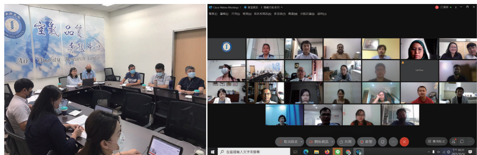
• Annual Training Courses on Health Investigation and Air Sensing for Asian Pollution (2019, 2020, 2021)