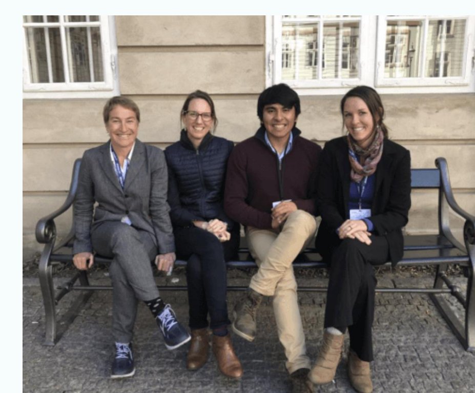
Member of the Ocean KAN Development Team